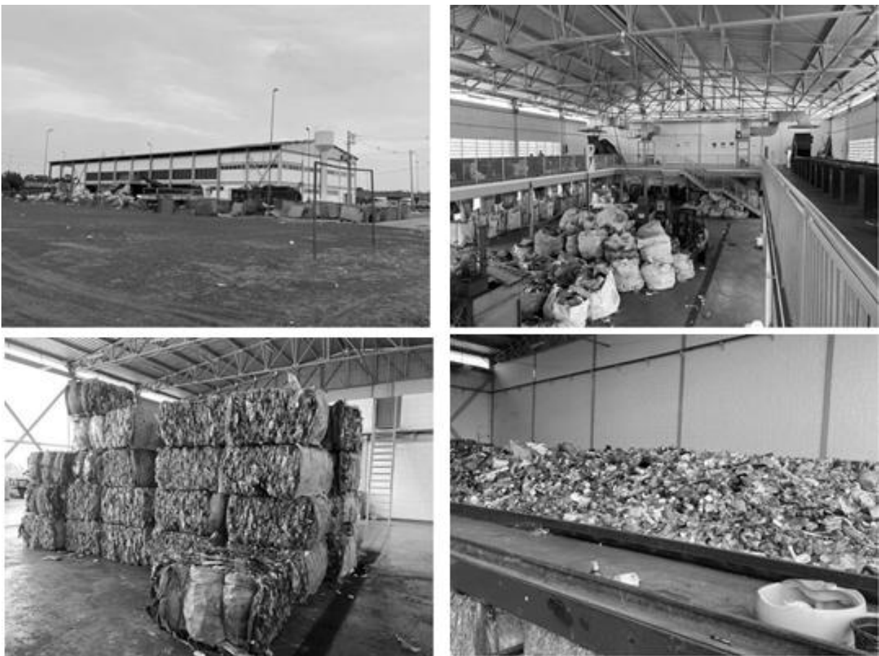
Figure 3: FD Recyclable Materials Cooperatives Centre (CENTCOOP-DF)

The history of collector cooperatives in the Federal District dates back to the former "Lixão da Estrutural", considered the largest open-air dump in Latin America (Campos, 2018). The eight cooperatives from this location were installed in five warehouses rented by UCS to handle recyclable materials. Notably, the quantities of Solid Waste received by the cooperatives are those delivered by the UCS. However, the volume of waste also contains materials from their collections or donations (Federal District, 2022). Below are photographic records of the on-site visit to the main CENTCOOP-DF warehouse (Figure 3), where collectors work in sorting, weighing, pressing, and shipping part of the recyclable materials collected in the federal capital.